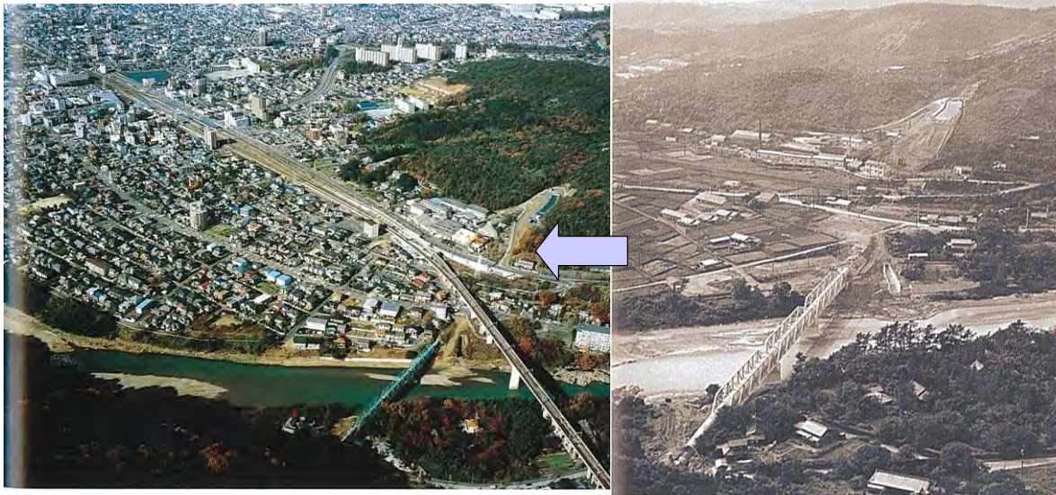
Fig.2 Rapidly developed surrounding area of Aichi Canal

To cope with shortages in potable and industrial water supplies, water allocation between irrigation, potable water and industrial water was changed in 1964 so that part of the volume originally allocated for irrigation was reallocated to the latter two sectors. For this reallocation was not enough to meet the growing water demand in the urban sectors, the Aichi Canal system as a whole shortly approached to its capacity limit.