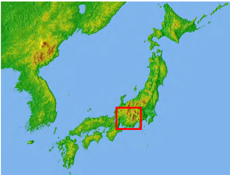
Fig.1 Location map of the Aichi Canal

The Chita Peninsula does not have a big river or a notable aquifer because of its narrow and hilly topography. The rainfall flows into the sea rapidly; therefore, it was 15,000 small reservoirs that would support the agriculture in the peninsula. People in the Chita Peninsula used to depend 70 to 90 percent of irrigation water on those reservoirs, or “dish-ponds”, which were unreliable water sources with very limited capacities. Droughts would hit the area about once in three years, and the crops would be seriously damaged every time.