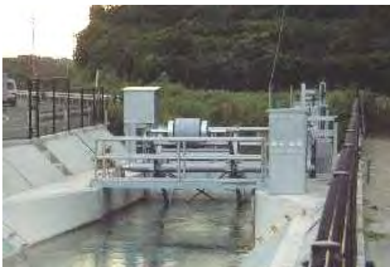
Fig.4 Mechanical Automatic Check-Gate

In the Aichi Canal 2 nd Phase Project, the main irrigation channel was given a function of regulating ponds with the help of automatic check-gates because lateral systems were converted into pipelines.